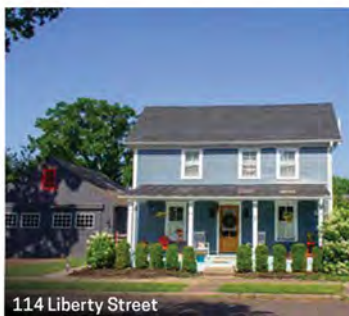
114 Liberty Street