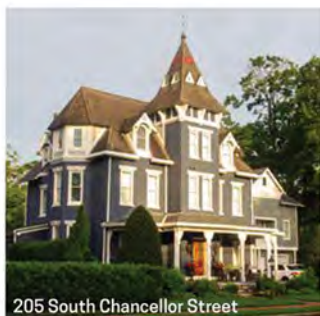
205 South Chancellor Street