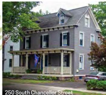
250 South Chancellor Street

Newtown Historic Association 2025 Holiday House Tour