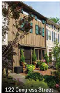
122 Congress Street

Newtown Historic Association 2025 Holiday House Tour