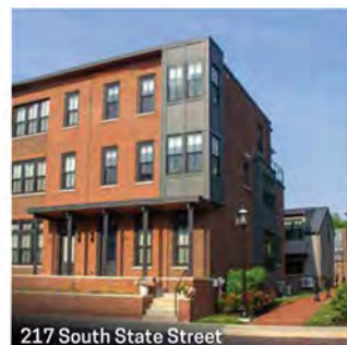
217 South State Street