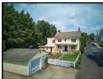
226 Court Street

Enjoy Newtown Borough living at its finest. These spectacular listings offer all the comfort and convenience of Borough living.