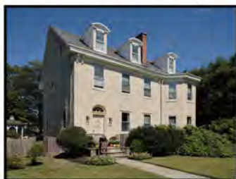
113 Penn Street